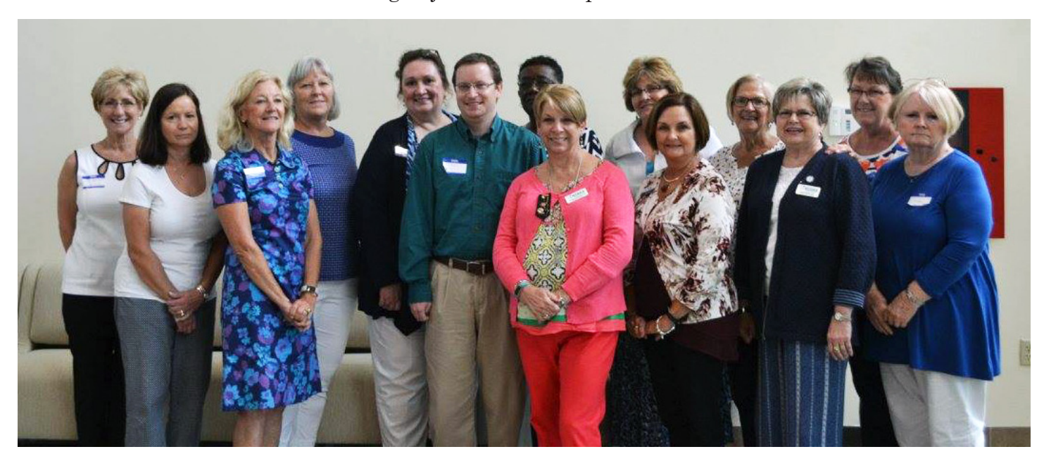
July 26, 2017 4th District Meeting in Erlanger, Kentucky.