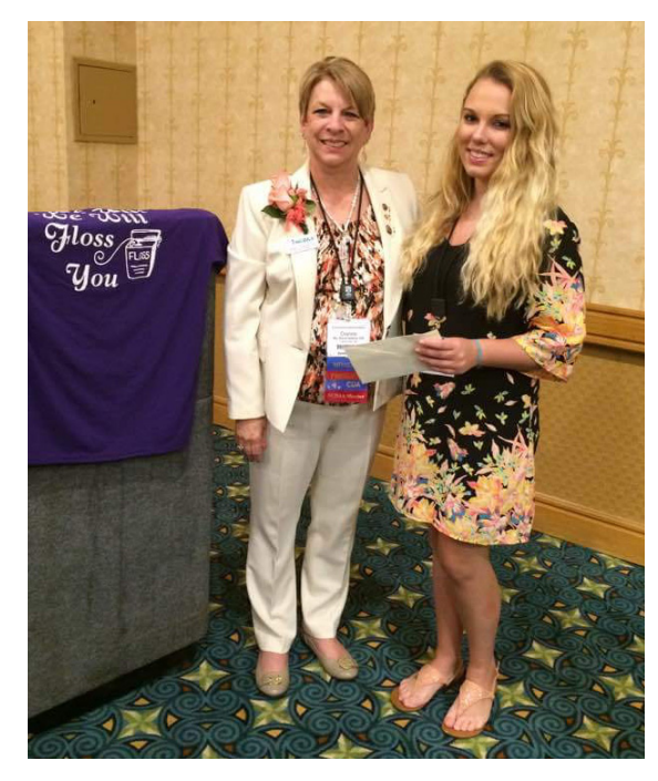
Winner of our T-Shirt Design 2017